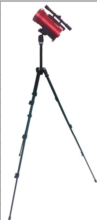
(in case of using the optional tripod)