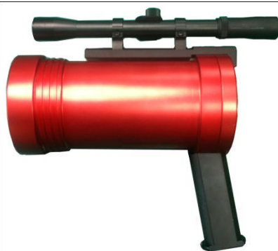
(In case of aiming at detector in hand-grasping)